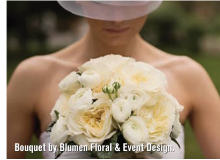
Bouquet by Blumen Floral & Event Design.