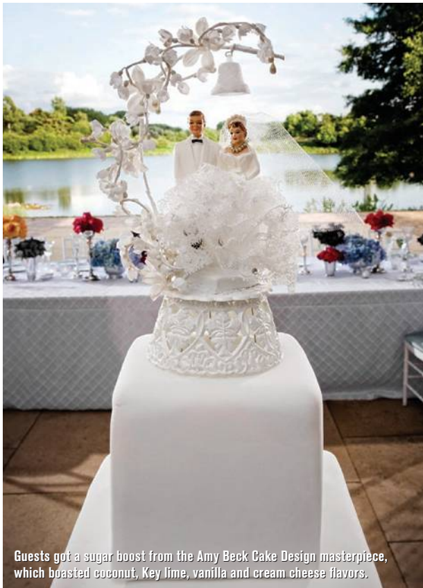
Guests got a sugar boost from the Amy Beck Cake Design masterpiece, which boasted coconut, Key lime, vanilla and cream cheese flavors.

Parties Etc. made sure even the French market-themed place card table was magnifique .