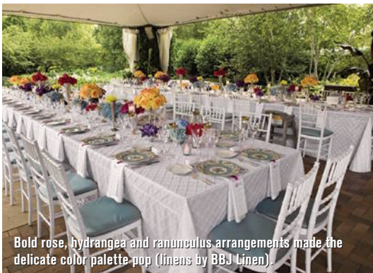
Bold rose, hydrangea and ranunculus arrangements made the delicate color palette pop (linens by BBJ Linen).