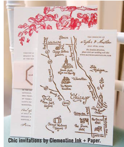
Chic invitations by Clementine Ink + Paper.

Parties Etc. made sure even the French market-themed place card table was magnifique .